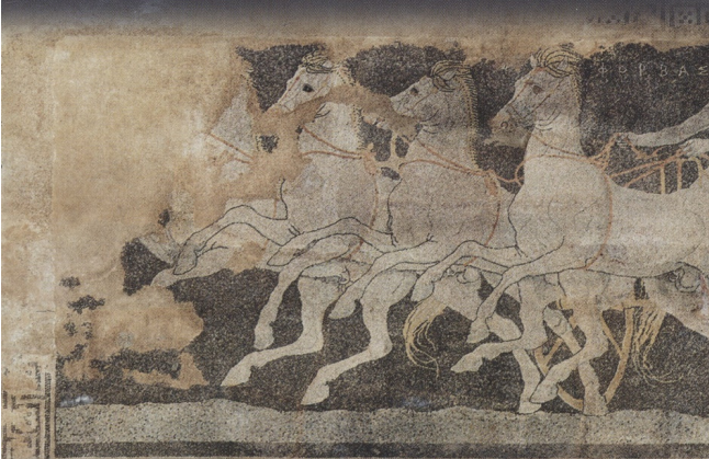
Mosaic floor depicting the abduction of Helen by Theseus (325-300 n.X.)

The Hellenistic city was built in the extension of the coastal, cosmopolitan, Classical city with the busy port. The limits of the city of Philip II and Alexander the Great are revealed by the small part of the northern city wall of the Classical era (11) , which came to light at a distance south from the Agora, in one of the main streets of the Hellenistic city.